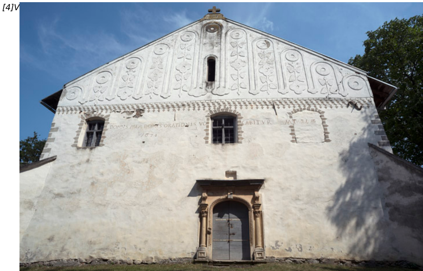
[5]enue: National Széchényi Library, National Relic exhibition place